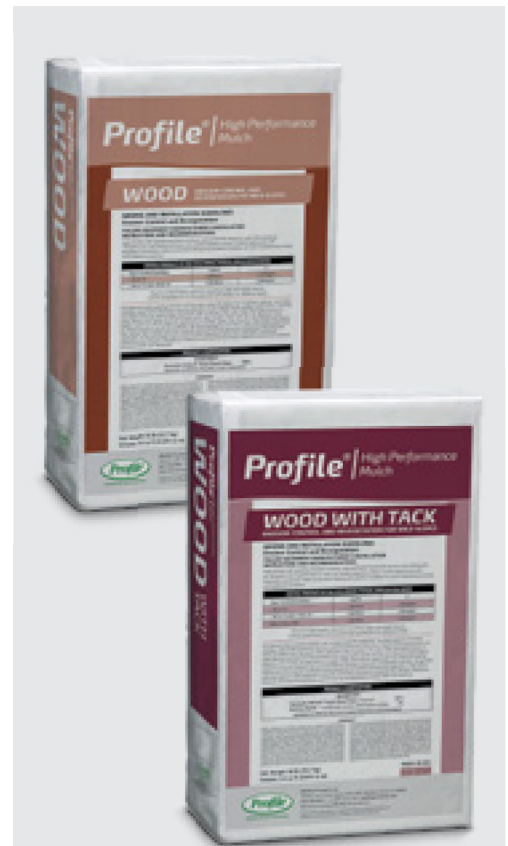
Made in Conover, North Carolina, USA